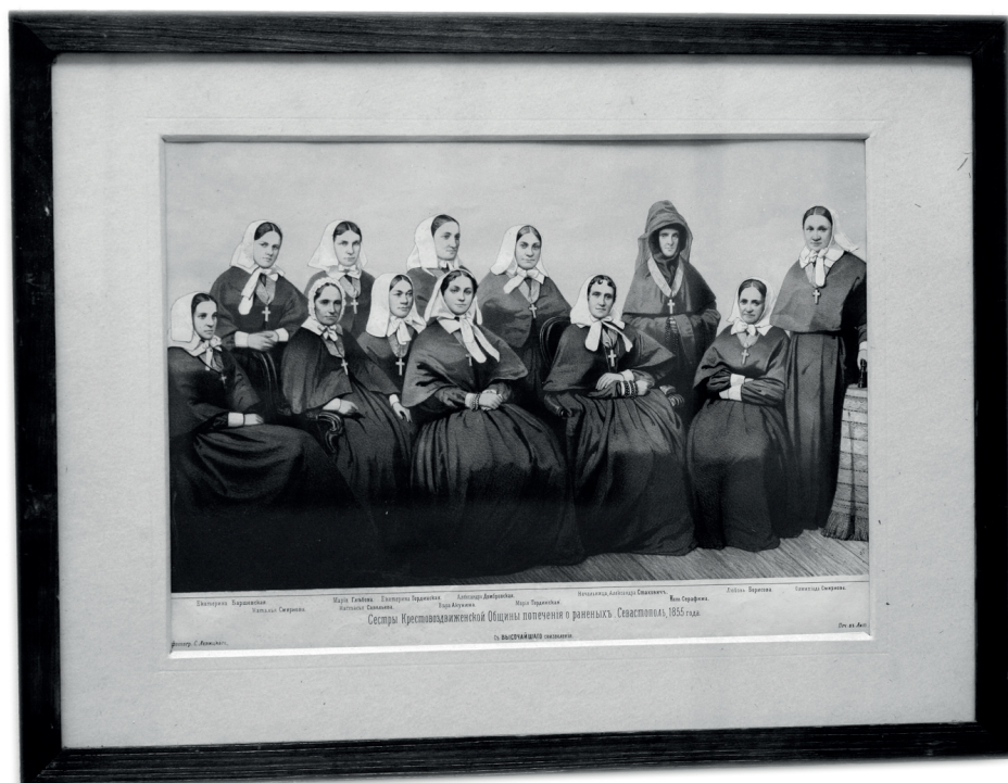
Figure 4. Lithograph: The first group of nurses who worked under Pirogov's leadership in Sevastopol during the Crimean War, 1854 – 1855. From the collections of Pauls Stradiņš Museum of the History of Medicine in Riga.