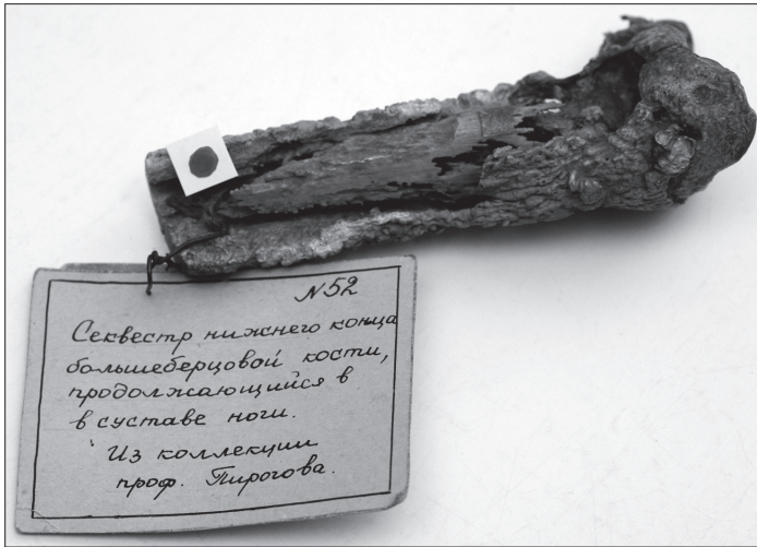
Figure 3. Pathological anatomy preparation from Pirogov's collection. 19 th century. Sequesters of the tibia. From the collections of Pauls Stradiņš Museum of the History of Medicine in Riga.

The exhibition displayed a wide array of documents, objects, books, brochures, postcards, photos and some artworks (engravings, paintings and sculptures) related to the life and activities of Nikolay Pirogov. Even the stamps issued in honour of his 150 th anniversary of his birth and some feature film posters were on exhibit. Among the most important items displayed were Pirogov's thesis on "Whether ligation of the ventral aorta is an easy and safe treatment in the case of aneurism of the groin" (Dorpat, 1832; in Latin and Russian) (Fig. 2), Pirogov's diploma from the Russian Association of Surgeons (1894), documents related to the acceptance of Pirogov at the Moscow University (1824), photos of prescriptions written by Pirogov (originals at the Pirogov Museum in Vishnya), as well as some objects of pathological anatomy from the 19 th century (Fig. 3), medical and surgical instruments of the 19 th century, lithographs of the battlefields of the Crimean War (Fig. 4), etc. Some of the anatomical drawings were made by Pirogov himself. Some of the items displayed on the exhibition were dedicated to his teachers Johann Gotthelf Fischer von Waldheim, Johann Christian Moyer, Efrem Mukhin, Justus Christian von Loder, etc.